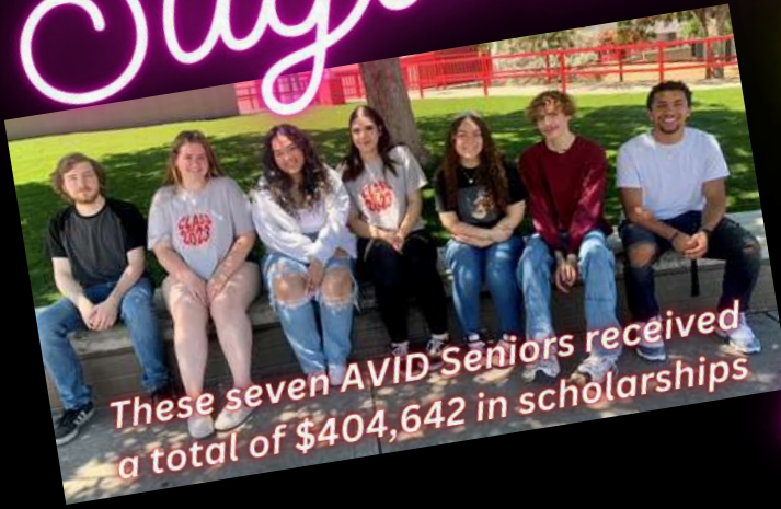
These seven AVID Seniors received a total of $404,642 in scholarships